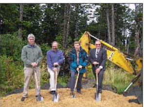
Craig ground breaking