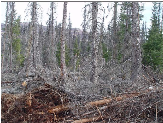
Spruce bark beetle damage