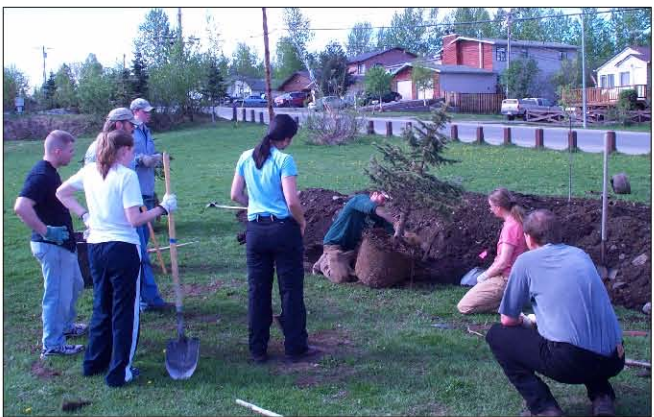
Anchorage TREErific volunteer tree planting