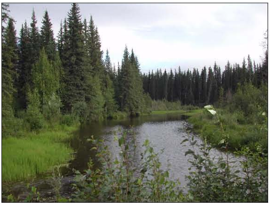
Colorado Creek Forest Legacy Project