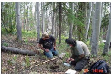
Technical assistance visit with forest landowner.

To provide natural resource management planning services to non-industrial private forest landowners to protect, maintain, enhance, and/or improve forests and watershed health, diversity, productivity, and sustainability