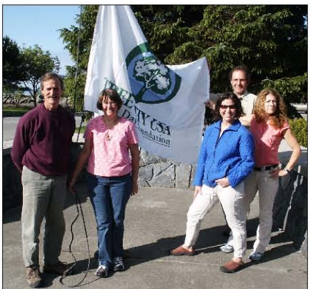
Sitka Tree City USA ceremony