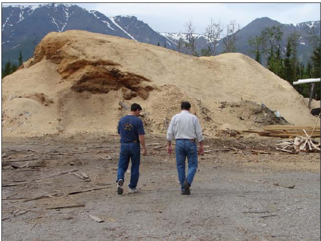
Logging and Milling Lumber Company sawdust pile. Dry Creek, Alaska