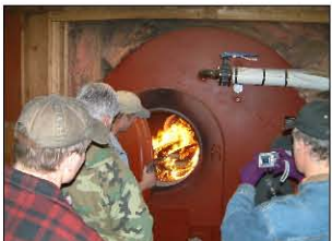
Dot Lake Garn unit