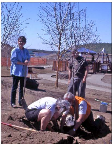
In 2002, Wasilla Mayor Sarah Palin celebrated Arbor Day by planting a tree in a city park. Wasilla is one of six Alaska communities designated as a Tree City USA.