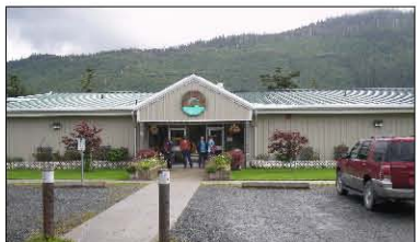
Craig community aquacenter